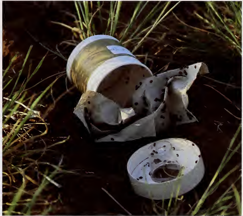
Releasing lady beetle adults in a field of Russian wheat aphid-infested wheat.

In 1987, APHIS began to release two other European lady beetles ( Hippodamia variegata [Goeze] and Propylea quatuordecimpunctata [L.]) that had also become established in northeastern North America. These species were initially released against various aphids to obtain the beetles' establishment throughout North America. Like the seven-spotted lady beetle, these predators are commonly associated with the Russian wheat